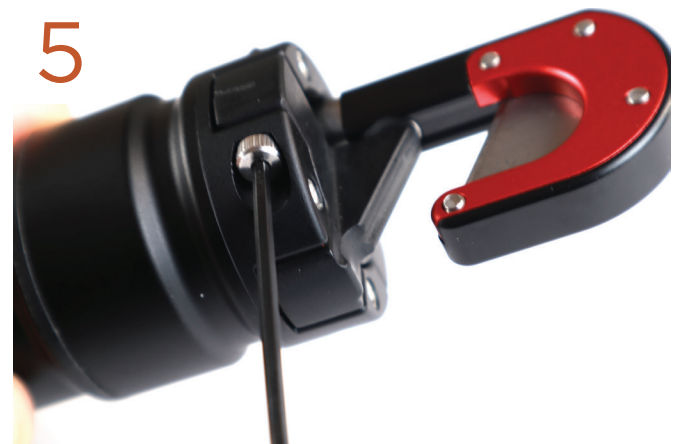
Place the blade seat and secure