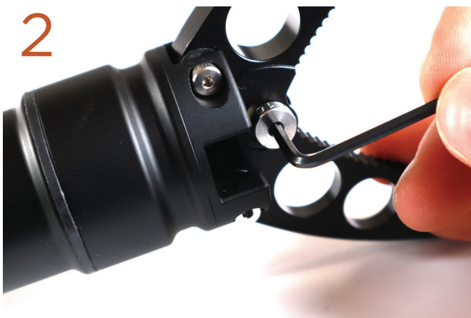
Remove the push rod screw