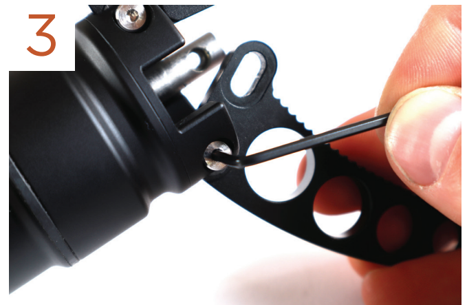
Remove the pivot screws for both jaws