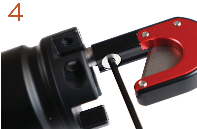
Attach the blade holder